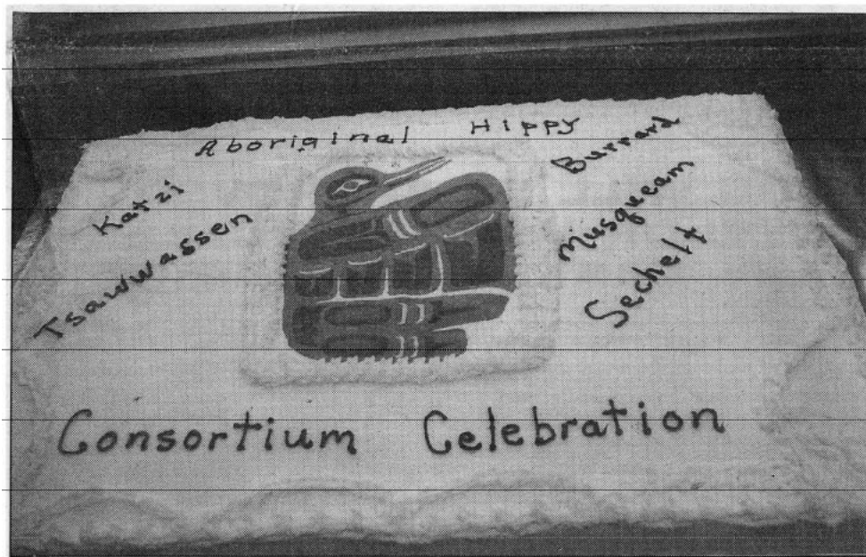
A cake for the HIPPY party at the Katzie First Nation.